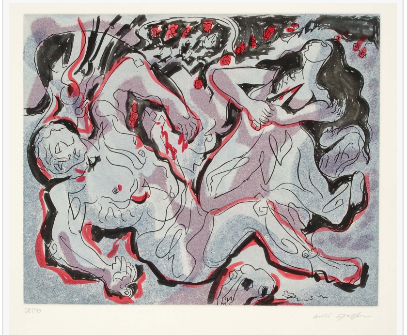
Andre Masson, Pyramus und Thisebe (Les Amants Celebres) hand-signed etching with aquatint, 15 x 18 inches