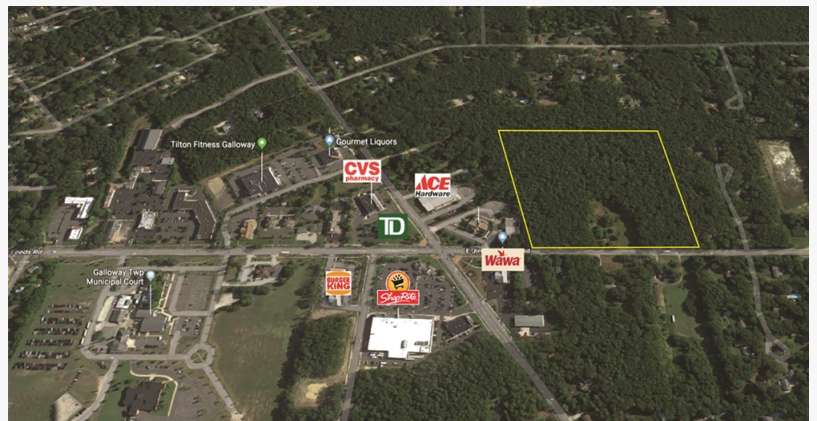
Galloway PA, 15.38+/- Acre Development Site

Another 15.38+/- Acre development site will go up for auction in Galloway Township, NJ on February 21, 2019 at 1:00 p.m. at the Holiday Inn Express & Suites in Absecon, NJ.