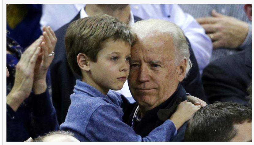
A Special Moment of Love

When he started to work on this issue, violence against women, children and men, were not taken as seriously, and survivors were not given the recourse they deserved. Too often, victims of violent crimes were blamed. Too often, perpetrators were not prosecuted.