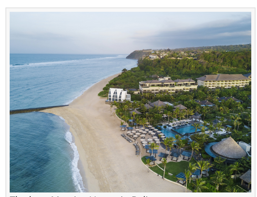
The best Meeting Venue in Bali

This press release can be viewed online at: http://www.einpresswire.com