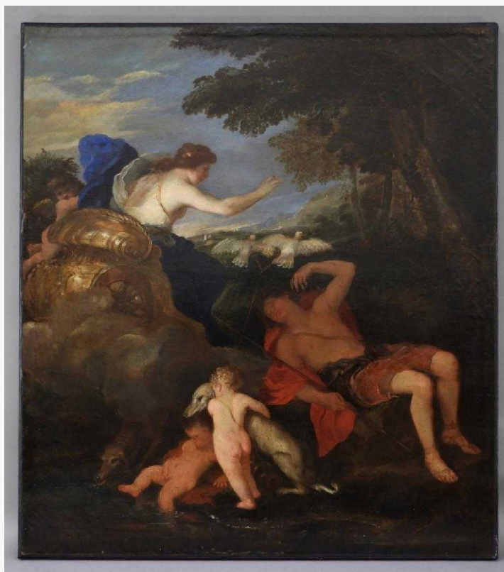
Italian rococo Old Master oil on canvas painting, done around 1750, a Neoclassical work depicting a divine beauty seated in a gold chariot pulled by doves ($6,875).