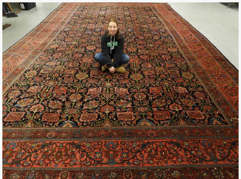
Monumental circa 1920 wool Bidjar rug, 24 feet 9 inches by 14 feet 11 with blue ground and an overall floral and tendril pattern with vibrant floral borders ($12,500).

"It was exciting to see the non-stop bidding on the Oriental rugs, proving the market is strong," said Bruneau & Co. president and auctioneer Kevin Bruneau. "It was also good to see a nice collection of contemporary photography sell with a lot of local interest. Overall, a great sale."