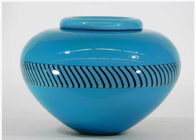
Italian Lino Tagliapietra Murano Incalmo glass vase, produced in collaboration with Maria Angelin, 9 ½ inches tall, of robust form with a rounded rim ($2,000).

This press release can be viewed online at: http://www.einpresswire.com