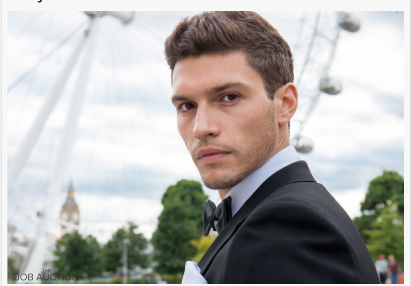
The Job Auction

This press release can be viewed online at: http://www.einpresswire.com