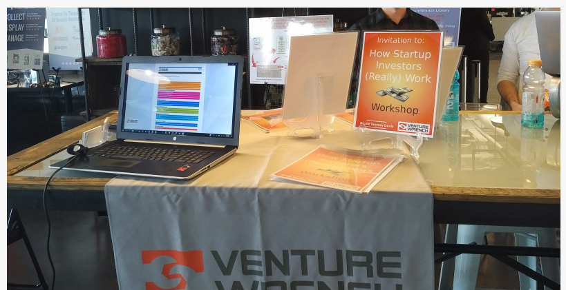
VentureWrench Startup Tools For Entrepreneurs Demonstration

America's Seed Fund powered by NSF awards $200 million annually to startups and small businesses, transforming scientific discovery into products and services with commercial and societal impact. Startups working across almost all areas of science and technology can receive up to $1.5 million in non-dilutive funds to support research and development (R&D), helping de-risk technology for commercial success. America's Seed Fund is congressionally mandated through the Small Business Innovation Research (SBIR) program. The NSF is an independent federal agency with a budget of about $7.8 billion that supports fundamental research and education across all fields of science and engineering. For more information, visit seedfund.nsf.gov .