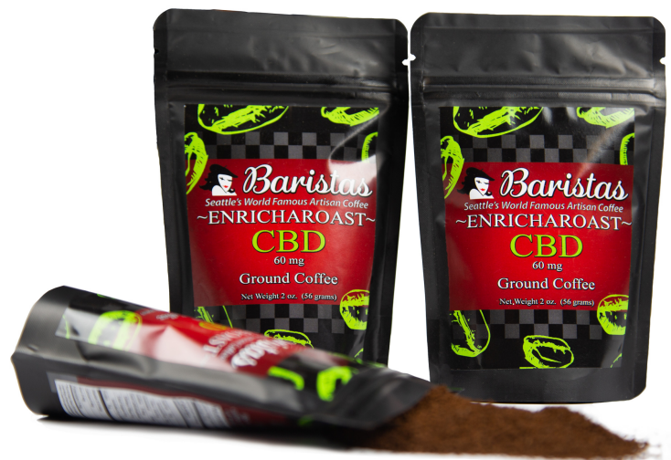
Baristas CBD EnrichaRoast2