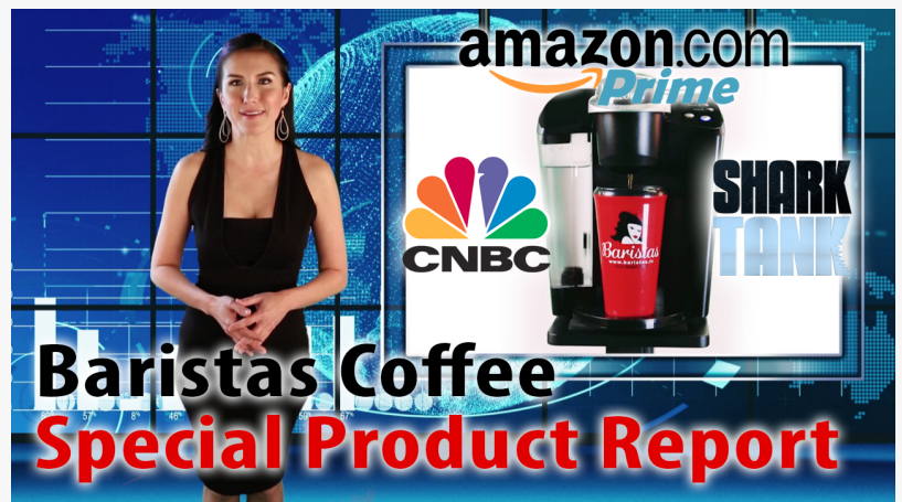
Front Montgomery Special Feature