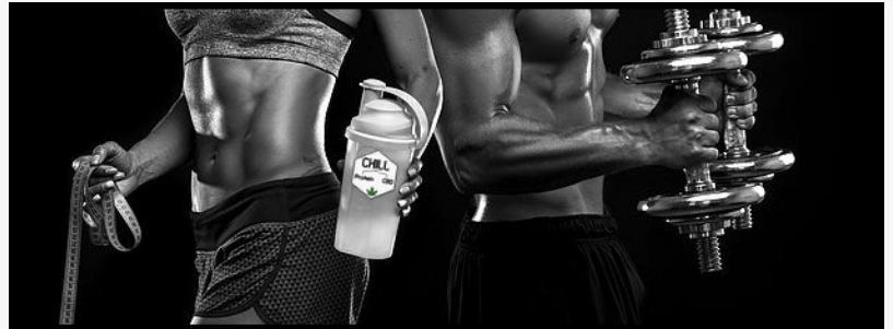
CHILL PROTEIN CBD FITNESS

www.chillprotein.com . Additionally the sites www.chillgolfing.com , www.chillfitnesscbd.com , www.chillfitcbd.com , www.chillbodycbd.com , and www.chillproteincbd.com will become active.