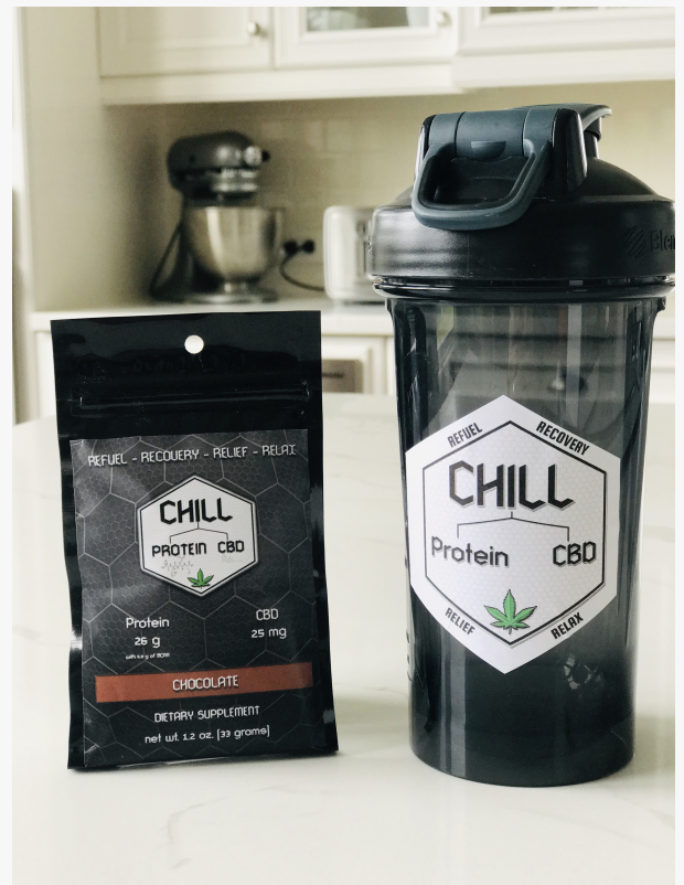
CHILL PROTEIN CBD PRODUCT PACKAGE