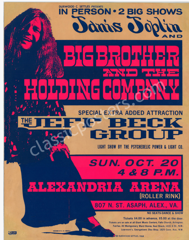
Very Rare 1968 Janis Joplin Jeff Beck Cardboard Poster

This press release can be viewed online at: http://www.einpresswire.com