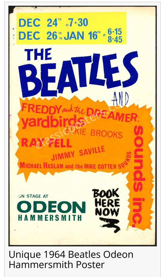
Unique 1964 Beatles Odeon Hammersmith Poster