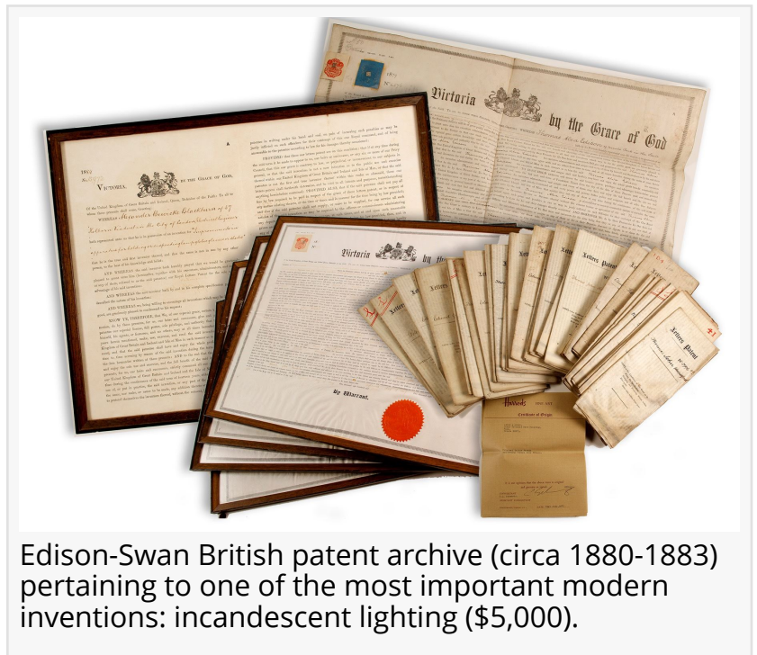
Edison-Swan British patent archive (circa 1880-1883) pertaining to one of the most important modern inventions: incandescent lighting ($5,000).