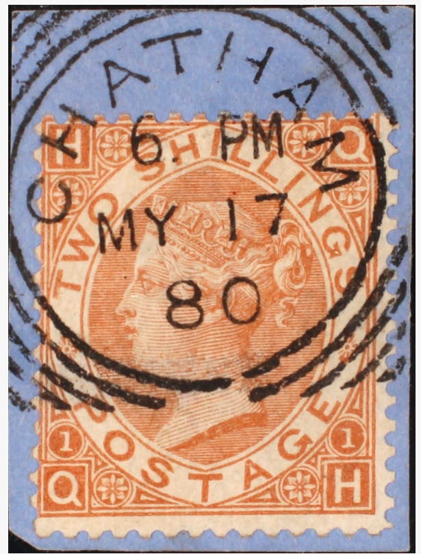
English 1880 brown two shilling Queen Victoria stamp ($2,900).

Holabird Western Americana is always seeking quality bottle, advertising, Americana and coin consignments for future auctions. To consign a single piece or a collection, you may call Fred Holabird at 775-851-1859 or 844-492-2766; or, you can e-mail