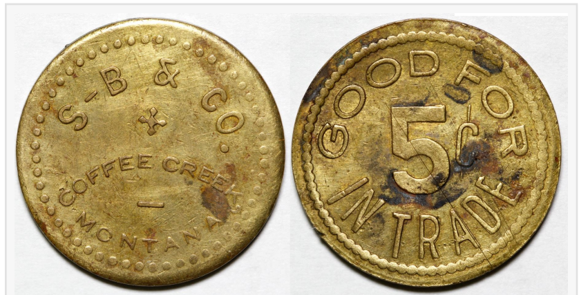
S-B Co. token (Coffee Creek, Mont.), "Good For 5 Cents In Trade" ($1,400).