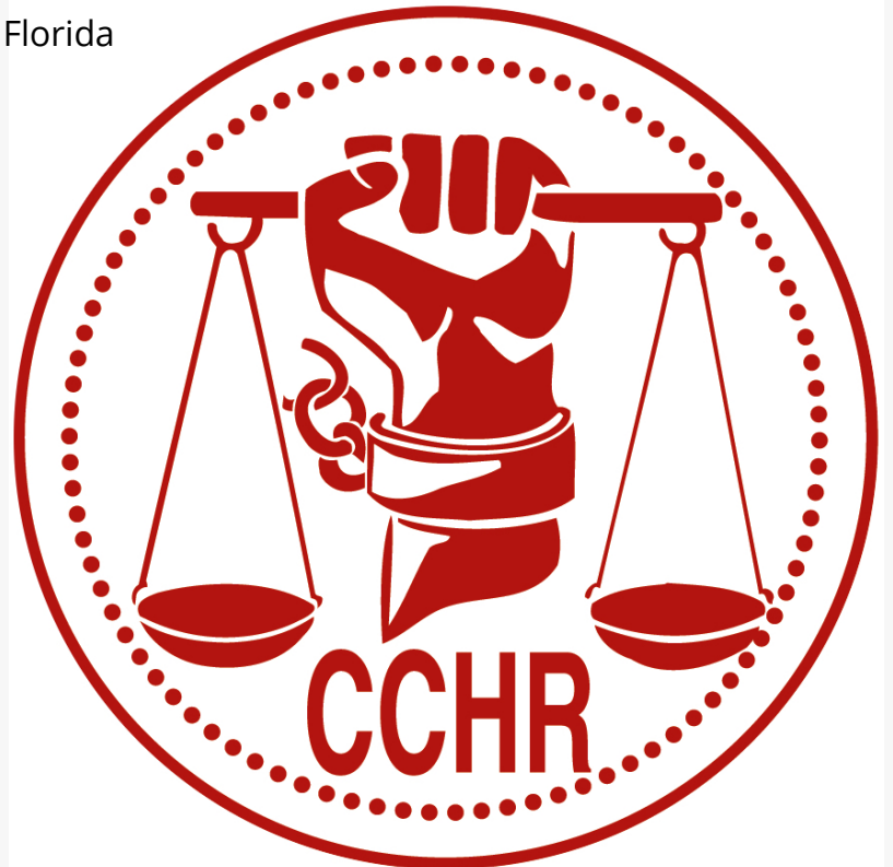
The Florida chapter of CCHR is a non-profit mental health watchdog.

This press release can be viewed online at: http://www.einpresswire.com