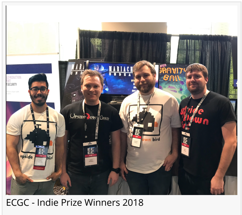
ECGC - Indie Prize Winners 2018

Last year Super Gravity Ball™ by Upside Down Bird won first place at ECGC and went on to win in London as well. The team earned passes to Casual Connect in London, a spot at their Indie Prize showcase and $1000 from ECGC. After all the hard work put forth by Upside Down Bird it finally paid off with the team winning the Indie Prize Best in Show Award from Casual Connect in London 2018.