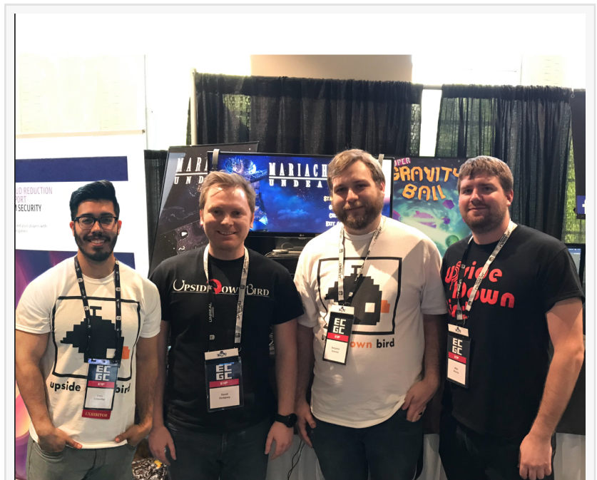
ECGC - Indie Prize Winners 2018

ECGC is proud that Super Gravity Ball™ by Upside Down Bird was the 2018 international winner. The team earned passes to Casual Connect in London a spot at their Indie Prize showcase and $1000 from ECGC. After all the hard work put forth by Upside Down Bird it finally paid off with the team winning the Indie Prize Best in Show Award from Casual Connect in London 2018.