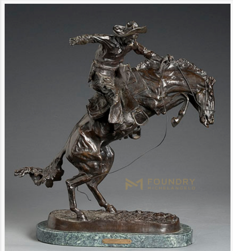
Contact Foundry Michelangelo: (360) 954-5453