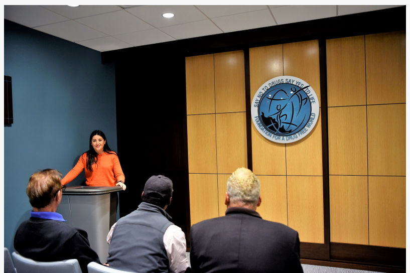
Community Outreach Coordinator for the Foundation for a Drug-Free World delivers seminar in Center

CLEARWATER, FLORIDA, US, February 7, 2019 /EINPresswire.com/ -- On January 23rd, the Foundation for a Drug-Free World (FDFW) Florida Chapter held a Truth About Alcohol seminar in its information center in downtown Clearwater. Guests learned about the short and long-term effects of alcohol: such as liver damage, nerve damage, vitamin deficiency, permanent damage to the brain, ulcers and inflammation of the stomach walls. As part of the seminar, the Truth About Drugs documentary DVD was shown with real people telling their hellish addiction stories.