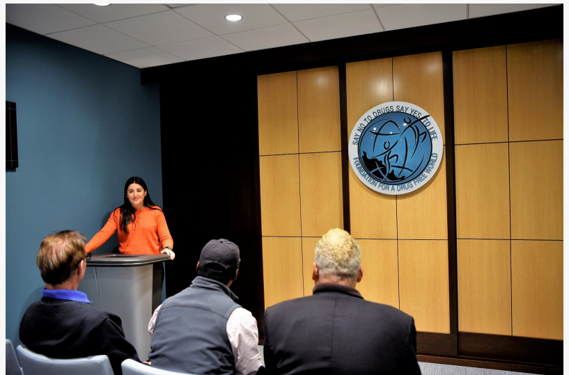
Community Outreach Coordinator for the Foundation for a Drug-Free World delivers seminar in Center

CLEARWATER, FLORIDA, US, February 7, 2019 /EINPresswire.com/ -- On January 23rd, the Foundation for a Drug-Free World (FDFW) Florida Chapter held a Truth About Alcohol seminar in its information center in downtown Clearwater. Guests learned about the short and long-term effects of alcohol: such as liver damage, nerve damage, vitamin deficiency, permanent damage to the brain, ulcers and inflammation of the stomach walls. As part of the seminar, the Truth About Drugs documentary DVD was shown with real people telling their hellish addiction stories.