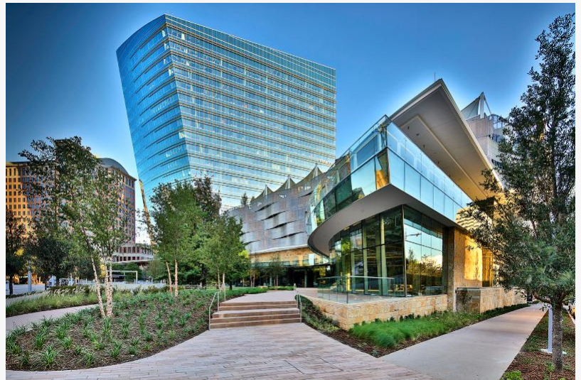
The Pelli Clarke Pelli Architects design McKinney & Olive provides a welcoming street-level view in pedestrian-friendly Uptown Dallas.

DALLAS, TEXAS, US, February 7, 2019 /EINPresswire.com/ -- Crescent Real Estate LLC (Crescent) and J.P. Morgan Asset Management announced today that McKinney & Olive earned additional recognition as an environmentally friendly and customer-focused building when it secured LEED® v4 for Building Operations & Maintenance: Existing Buildings Gold certification from the U.S. Green Building Council. USGBC LEED v4 certification is the most rigorous of the green building program designations.