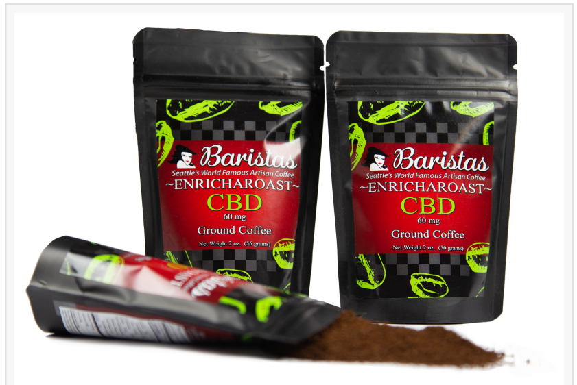
Baristas CBD Grammys

About Baristas Coffee Company: Baristas is a national Coffee Company that is recognized throughout the US. It currently produces and sells coffee related products under the Baristas brand. The Baristas White Coffee single-serve cups compatible with the Keurig 2.0 brewing system is the bestselling product in its category. Baristas also markets other coffee related