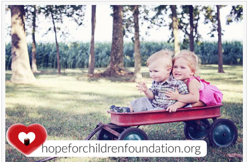
Valentine's Day is a great time to express love to all.