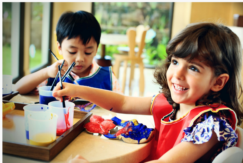
Mask Painting for Kids

Consistently ranked as one of the best family hotels in Bali , the beautiful beachfront resort has carefully created Easter-themed “happenings” at Ritz Kids on Easter Sunday to appeal to its youngest guests. That means Easter egg hunts, Easter egg decoration, rabbit mask making, basket decoration and tree planting. All the usual swim and slide fun also awaits at the Ritz Kids pool. Highlights on Good Friday include Janur creation, cupcake decorating and fish feeding, while on Easter Saturday children can join yoga, learn to play rindik the Balinese music and enjoy golf fun. While children are having fun at Ritz Kids, parents can enjoy a long and leisurely Mediterranean-inspired Easter