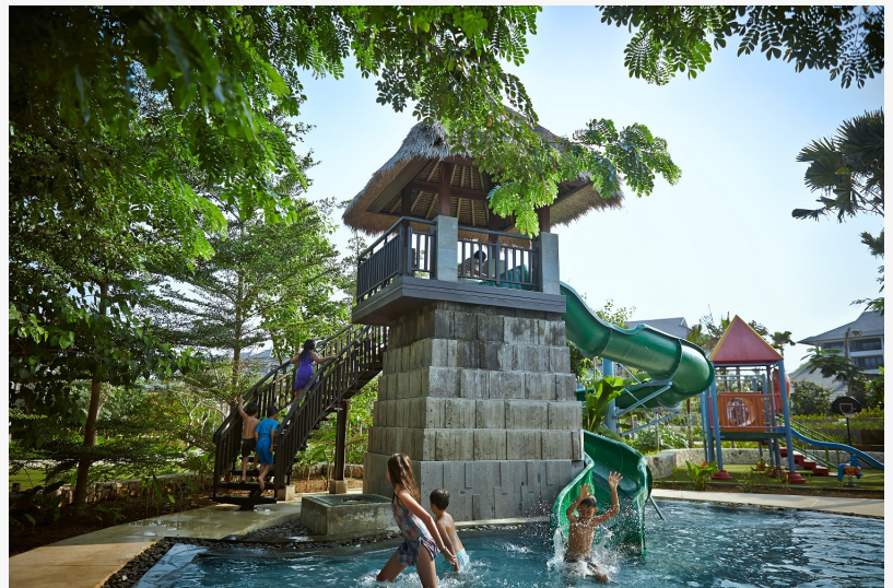
Ritz Kids dedicated kids pool