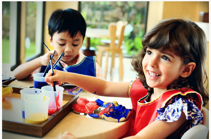
Mask Painting for Kids

Consistently ranked as one of the best family hotels in Bali , the beautiful beachfront resort has carefully created Easter-themed “happenings” at Ritz Kids on Easter Sunday to appeal to its youngest guests. That means Easter egg hunts, Easter egg decoration, rabbit mask making, basket decoration and tree planting. All the usual swim and slide fun also awaits at the Ritz Kids pool. Highlights on Good Friday include Janur creation, cupcake decorating and fish feeding, while on Easter Saturday children can join yoga, learn to play rindik the Balinese music and enjoy golf fun. While children are having fun at Ritz Kids, parents can enjoy a long and leisurely Mediterranean-inspired Easter