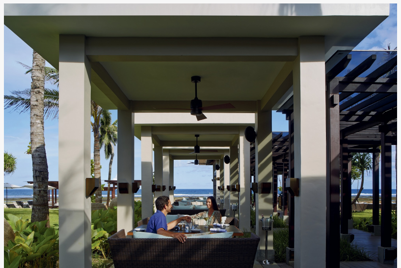
Easter Sunday Brunch by the Indian Ocean