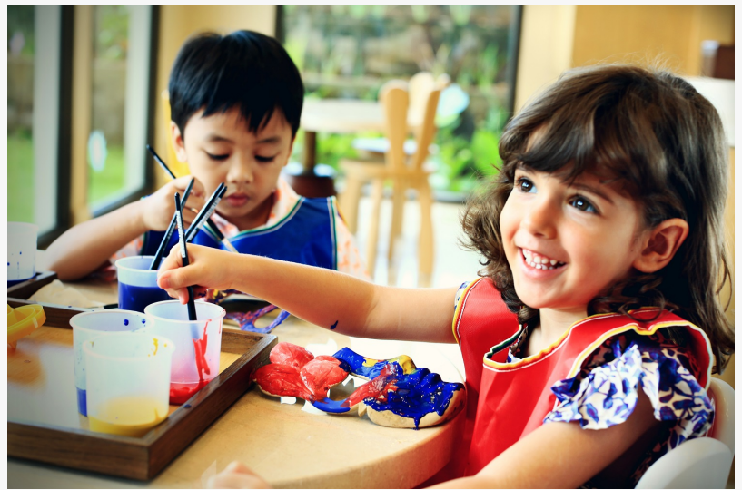
Mask Painting for Kids