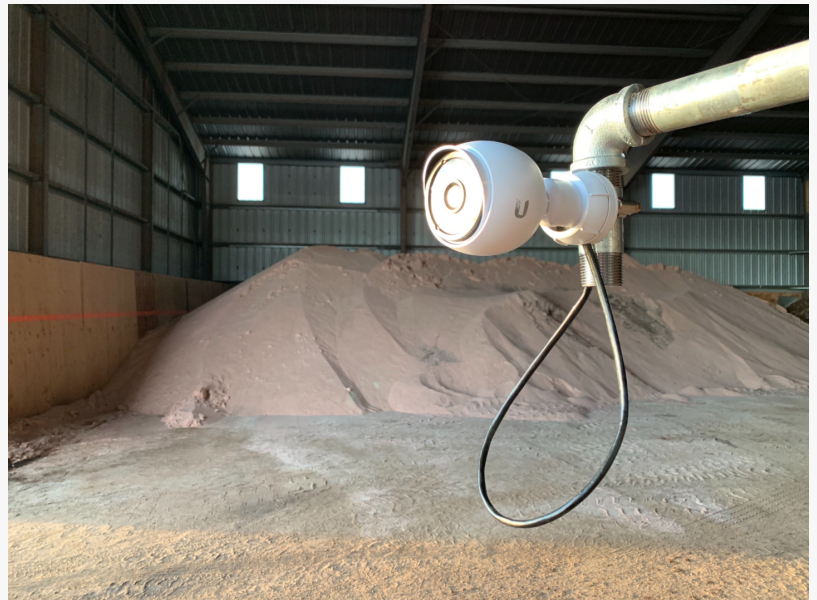
Fixed Camera Rig

Stockpile Reports® for Logistics has low cost fixed camera solutions ranging from do-it-yourself iPhone setups to ruggedized industrial cameras with infrared and self cleaning lenses. All of these camera rigs automatically collect imagery, sending it to the Stockpile Reports patented image-processing platform, generating precise and reliable volumetric reports, with no human involvement.