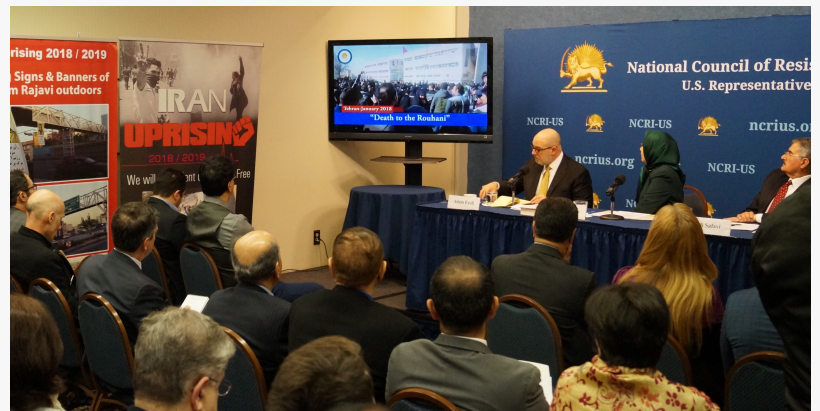
video clip of continued uprising shown at the event