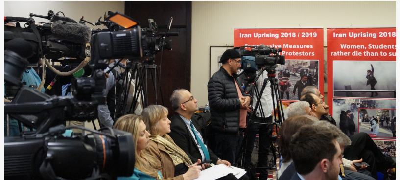
Media interest at the event on the anniversary of the Iranian revolution