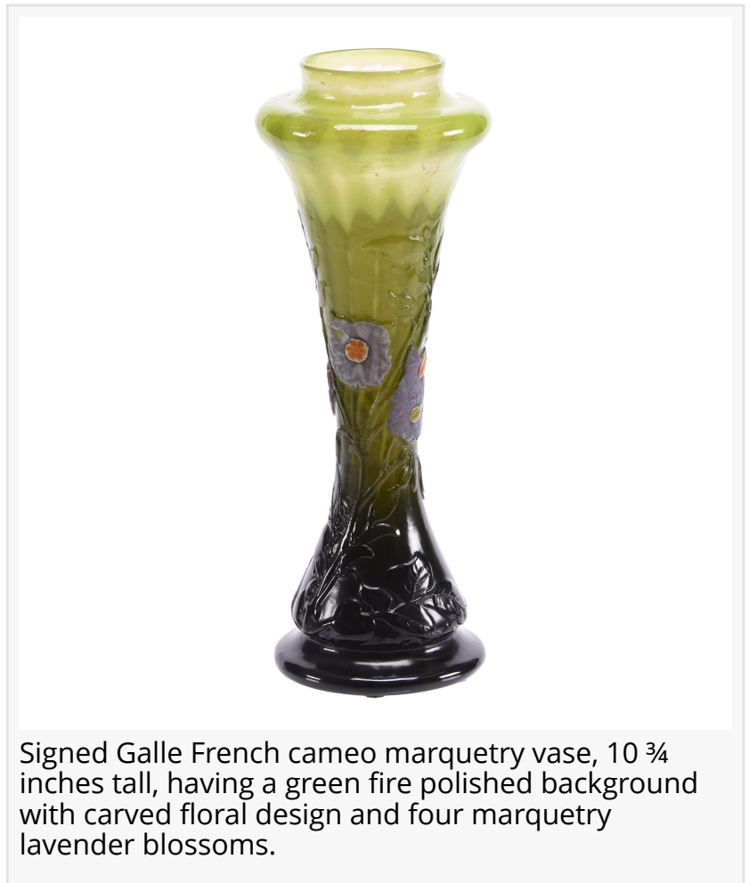
Signed Galle French cameo marquetry vase, 10 3 / 4 inches tall, having a green fire polished background with carved floral design and four marquetry lavender blossoms.

Jason Woody Woody Auction +17708420212 email us here