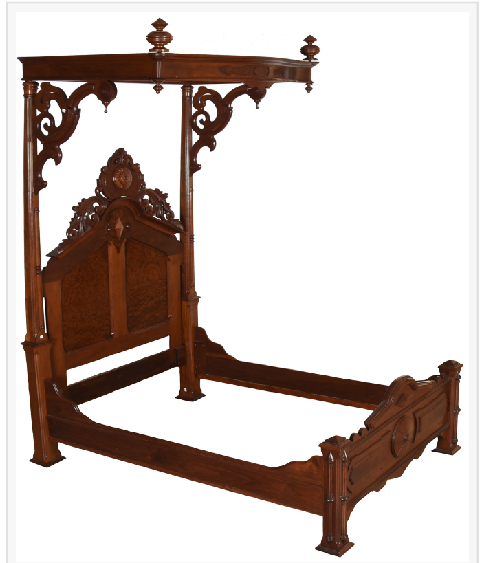
Victorian walnut half tester bed, 106 inches by 86 inches by 62 inches, having a white silk and walnut canopy with elaborate scrollwork and beautiful burl highlights.

This press release can be viewed online at: http://www.einpresswire.com