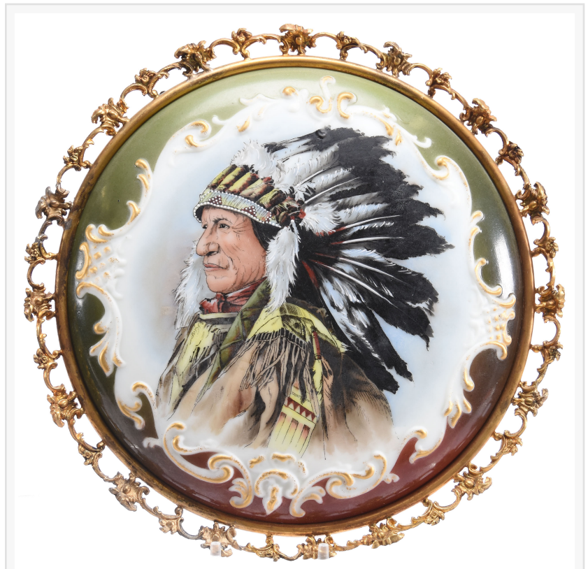
Wave Crest plaques from the collection of Don and Carrol Lyle will be led by this magnificent round example, having an Indian Chief portrait with beaded enamel highlights and set in a gilt metal frame.

Absentee bids will be accepted, with a written statement indicating the amount of the bid. The