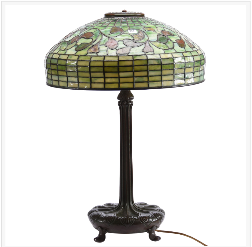
Original Tiffany "Whirling Leaves" table lamp, 25 ½ inches tall, with three-light electrified lamp base and lovely green slag panels with autumn colored leaf highlights.