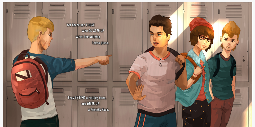
BULLIED - Upstander

where hopefully life gets better for everyone involved.