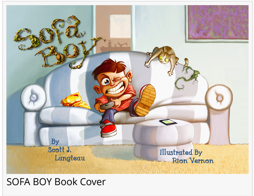
SOFA BOY Book Cover