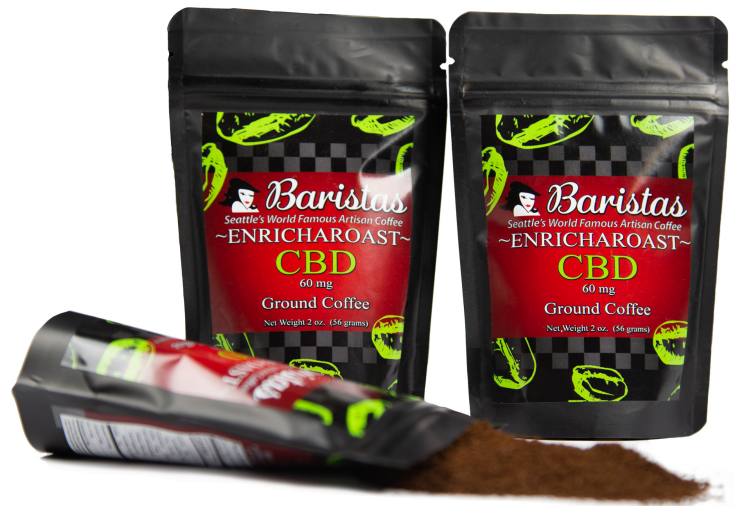
Baristas CBD Super Bowl