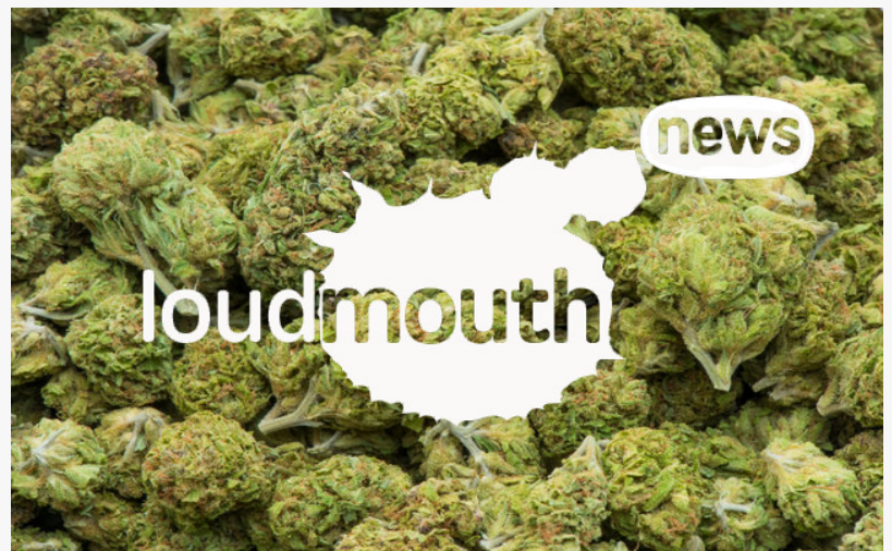
LoudMouth News Radio

running syndicated terrestrial radio news program in North America that focuses on the news relating to the marijuana industry in the USA, and can be also be heard via syndicated networks across Canada. LoudMouth News presents the news and commentary in an entertaining neutral manner, highlighting the most impactful current news in politics, products, sociological issues, businesses, and the ever-changing perceptions of marijuana usage. LoudMouth News is