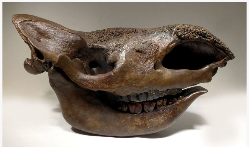
Complete Woolly Rhinoceros skull fossil from the Pleistocene era, 20,000-20,000 years old, found in Europe (the Meuse River in Belgium), not the Siberian Tundra (est. $50,000-$60,000).

With a pre-sale estimate of $50,000-$60,000, the Woolly Rhinoceros skull fossil is a strong candidate for top lot of the auction. The signature specimen is a complete skull from one of the most famous beasts of the last Ice Age. The fact that it was found in Europe (the Meuse River in Belgium) and not the Siberian Tundra, where most have been found, only adds to its desirability.