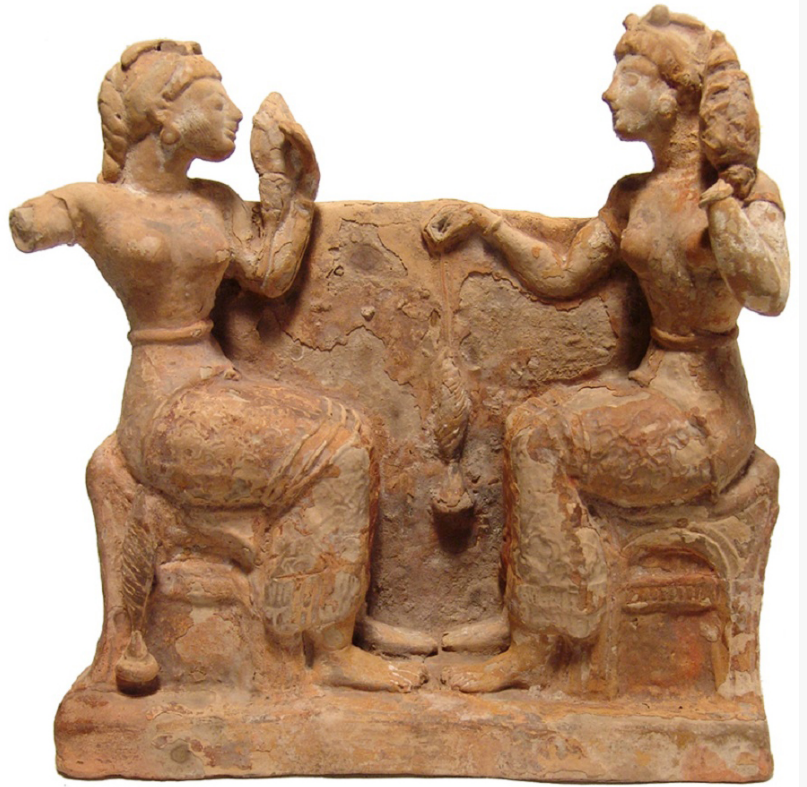
Greek terracotta relief scene from circa the 5th century BC, depicting two women seated on ornate chairs and facing each other, mold-made and partially in the round (est. $8,000-$12,000).