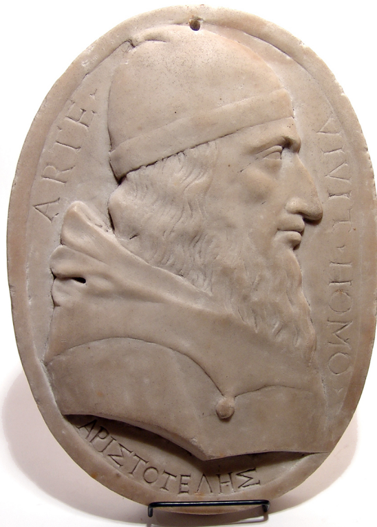
Lovely marble portrait of Aristotle, circa 15th-17th century, 14 ½ inches by 10 ¾ inches, with a Latin inscription (est. $3,000-$5,000).