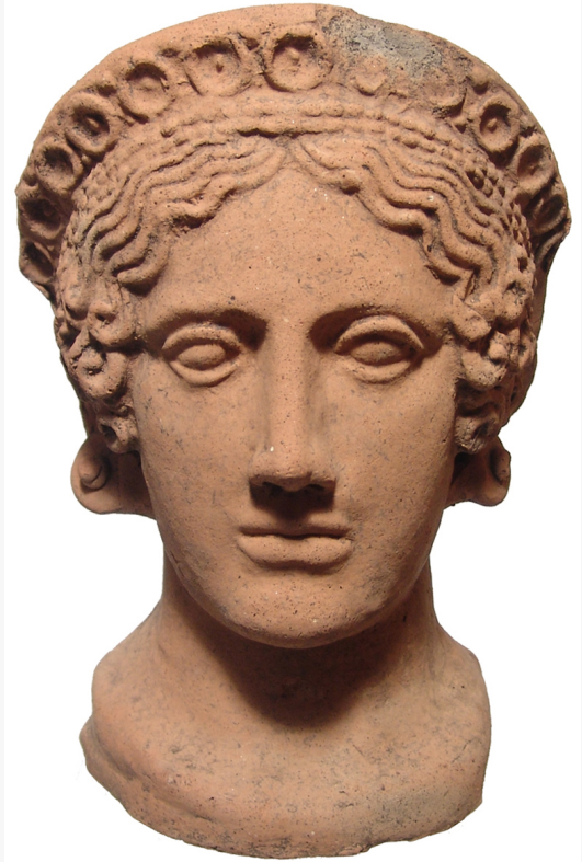
Etruscan terracotta female votive head, 4th Century BC, boasting beautifully modeled features in high relief, wearing a diadem adorned with rings and pellets (est. $5,500-$8,000).

Gabriel Vandervort Ancient Resource Auctions +1 818-425-9633 email us here