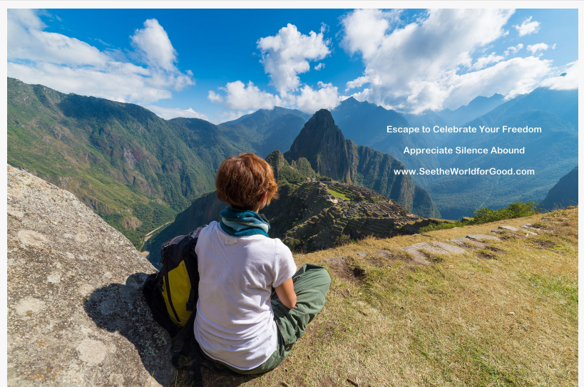
Experience Life Differently