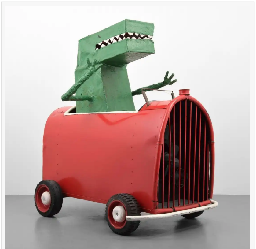
Herve Di Rosa (b. 1959-) sculpture of crocodile driving car, signed, French, 1983, metal, enameled metal and other media; car is 72in. wide. Auction estimate: $15,000-$20,000

UCA is especially honored to present at auction 10 lots of original art and celebrity ephemera