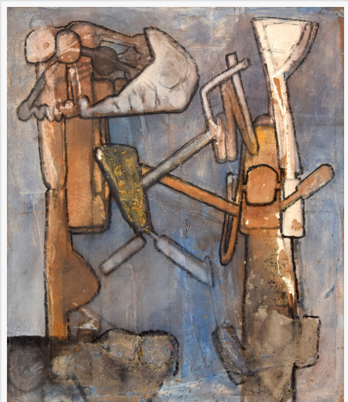
Roberto Matta (Chilean, 1911-2001), monumental oil-on-burlap painting, signed, 1961, 81 x 71in. (framed). Auction Estimate: $200,000-$300,000