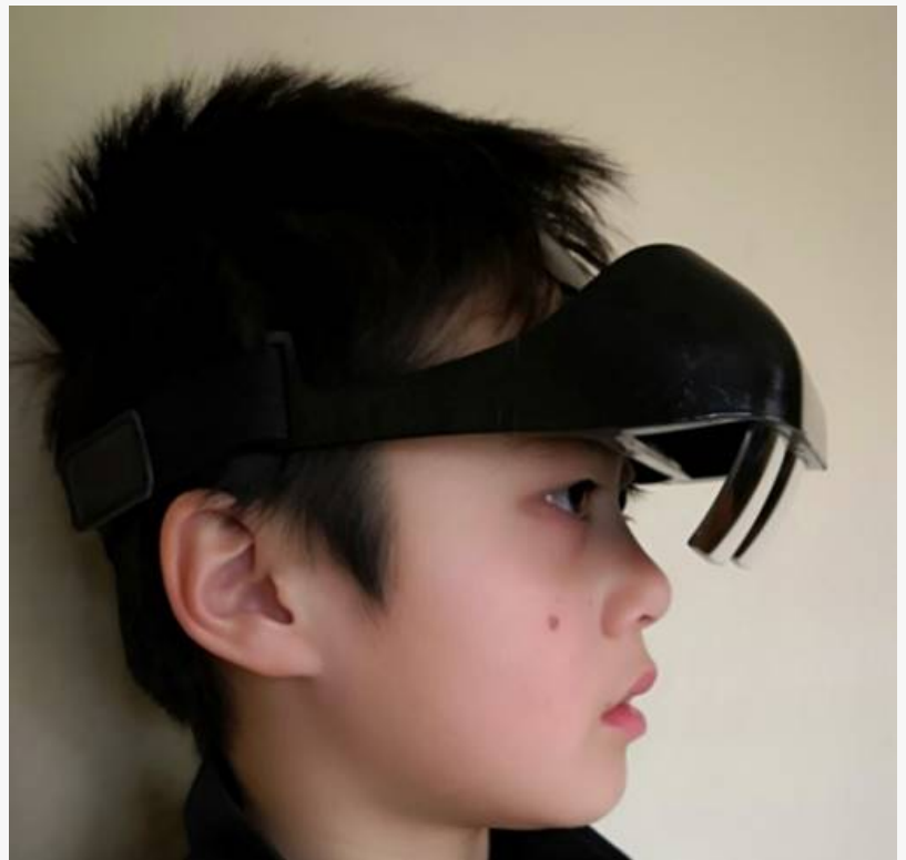
XGlass is 130g lightweight, even little kids can wear it long period of time