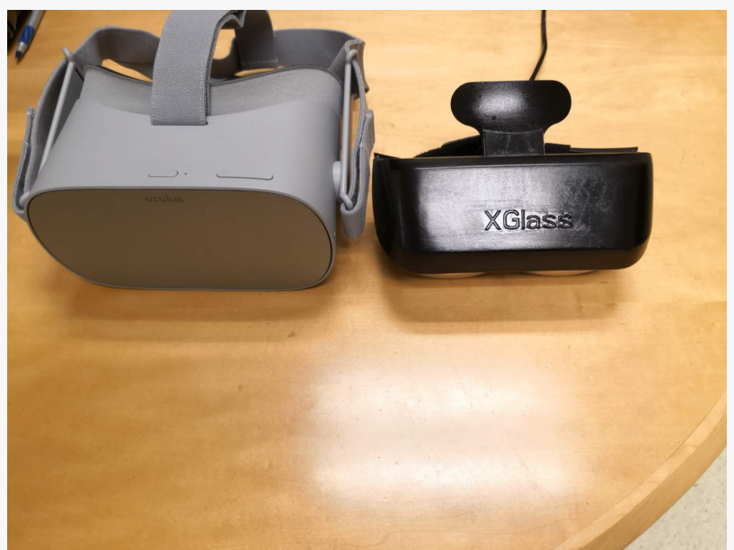
XGlass is much smaller and lighter than Oculus Go

"Unlike streaming on your Phone, PAD or TV, where others can easily spot what you are watching, XGlass projects the content directly to your retina, so you are the only person who can see the 30-foot huge screen in front of you. You could well be watching your favorite Victoria Secret Fashion Show without concerning your next seat neighbor on the airplane knows what you are enjoying. This type of experience is what we called Total Privacy protection on XGlass", says Sam.