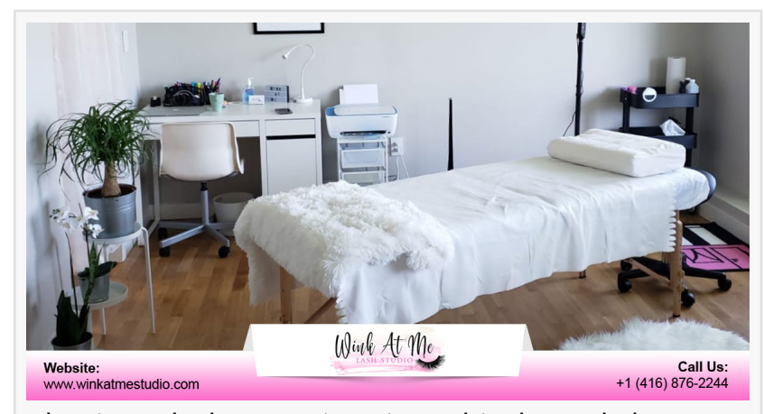
Classic Eyelash extensions in Etobicoke and The Greater Toronto Area

Candice Peel Wink At Me Lash Studio +1 416-876-2244 email us here Visit us on social media: Facebook Twitter LinkedIn