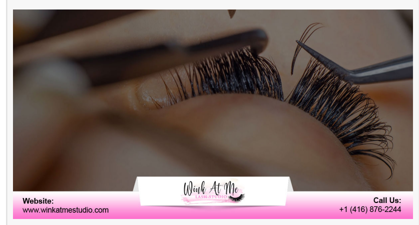
High-end Classic and Volume Eyelash Extensions Services