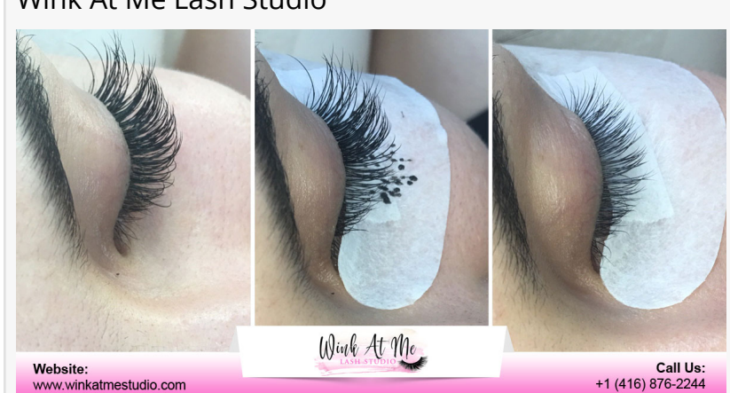
Best Eyelash Extensions in Etobicoke Ontario