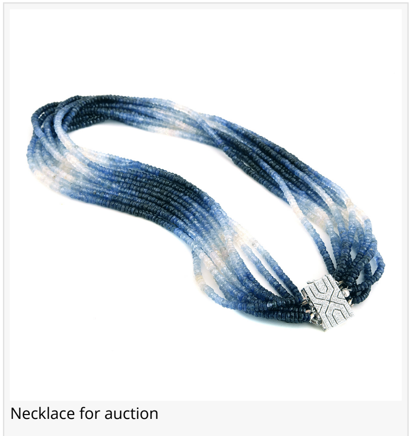
Necklace for auction

A standout in March is the custom diamond ring designed as a comet, with a trail of diamonds following from the brilliant-cut center stone of over one carat ($2,000-$3,000). The sapphire ombré bead necklace ($1,800-$2,500) is another highlight. A gleaming 18k gold bracelet, heavy with gold coins and charms, is estimated at $4,000-$6,000. 25 of the March jewelry lots come from the estate of Wylda Hammond Nelson, MD, who collected beads and tribal jewelry from around the world. These lots include the ancient Persian necklace ($500-$700) of etched carnelian and carnelian beads. Estate furniture highlights include the McGuire bamboo form dining table and eight chairs, a great find at $1,000-$1,500. Luxury items in this auction include a Fendi fur and a Daum pitcher.