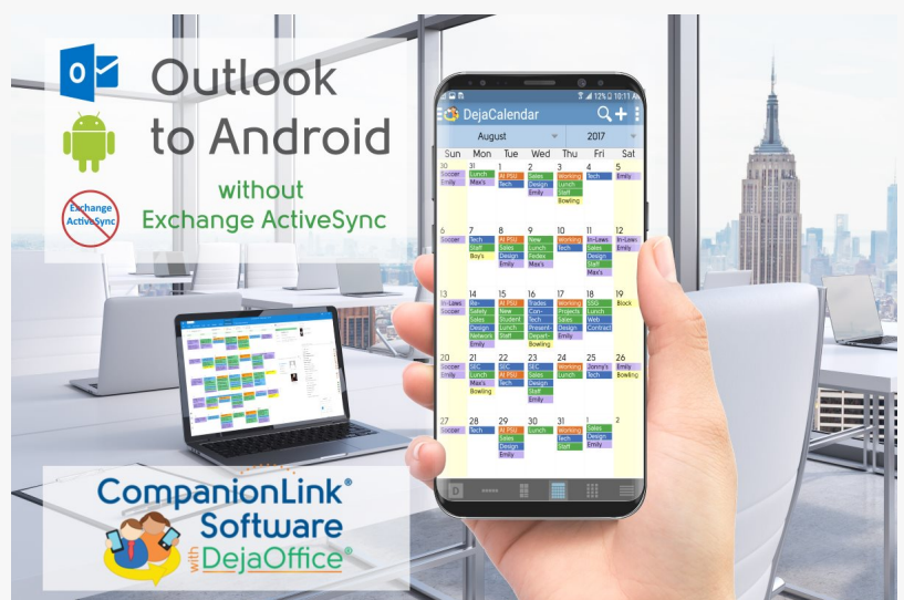
CompanionLink for Outlook and Samsung Galaxy

This press release can be viewed online at: http://www.einpresswire.com