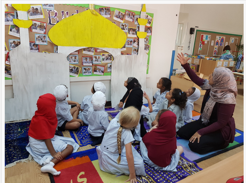
Learning Tolerance with teacher

For students, the VR class is a delightful time when they're en route to their favorite voyage. When asked, a student from.... school explains his experience of using Virtual Reality. "Virtual Reality makes me feel involved in the environment like I am a part of it. It's like being featured in a game. I was struggling with concepts like the anatomy of the nervous system and muscular system. With Virtual Reality, it became easy to view these lessons.", says a student of GEMS Education, Dubai.