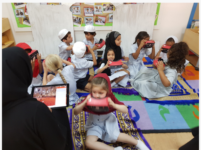
Learning Tolerance in Virtual Reality

DUBAI, UNITED ARAB EMIRATES, December 31, 2019 / EINPresswire.com/ -- Establishing themselves as a vibrant, progressive society, the Middle East has laid special emphasis on equitable quality education and lifelong learning opportunities. The leaders here understand that citizen participation and accountability in futuristic progress can be enhanced through a qualitative improvement in the education system. Consequently, the Middle East has become a flagbearer of innovation in education. Virtual Reality remains at the helm of these progressions, and it is being exhaustively deployed in schools.