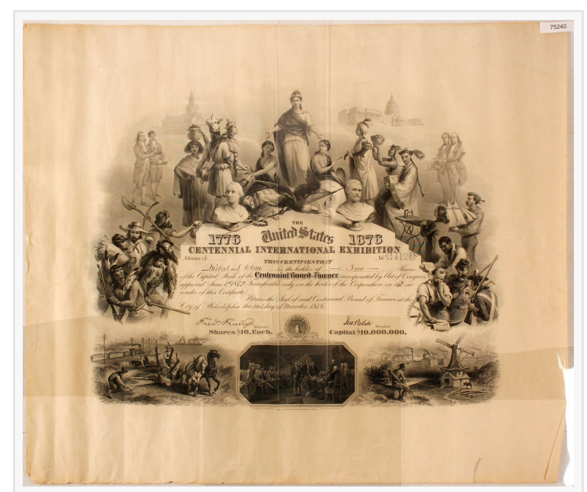
Stock certificate (in the amount of five shares) for the famous 1876 Centennial Expo (est. $800-$2,000).

Day 3, Saturday, March 9th, will contain Part 1 of the Native Americana, to include artwork, apparel, gloves, moccasins, accessories, jewelry, trade beads, artifacts, pipes, dies and baby baskets – 522 lots in all. Also sold that day will be 52 lots of artwork, for a total of 604 lots.