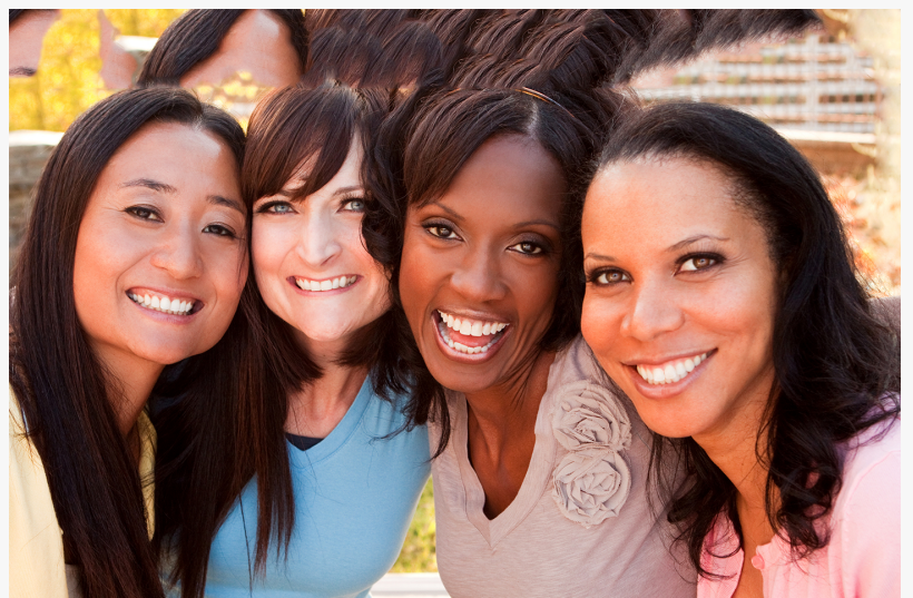
Lighting Your Path - Join Us!

DALLAS, TX, USA, February 28, 2019 /EINPresswire.com/ -- Join us on Sunday, May 5, at Tower Club Dallas for a free, unique support experience: Lighting Your Path -- Lighting Your Path – Survivorship After Breast Cancer. Breast cancer survivors, their caregivers/loved ones, and people who want to better support friends with breast cancer are encouraged to attend.