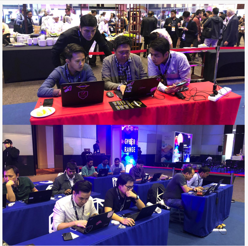
Red and Blue at CPX 360 Bangkok.jpeg

Cypire ( www.cypire.com ) was founded by cyber, simulation, training and gaming experts, who believe that mission-ready cyber professionals are a key to a safer world. The company develops unparalleled cyber training solutions for both red and blue teams. SPARTA, Cypire's flagship product is a flexible, cloud-based fully gamified cyber simulator that can support any network typology or IT system. The platform runs scenarios simulating the most up to date cyber threats. Cypire's products can support any vertical and are already in use by multiple commercial, governmental and educational organizations.