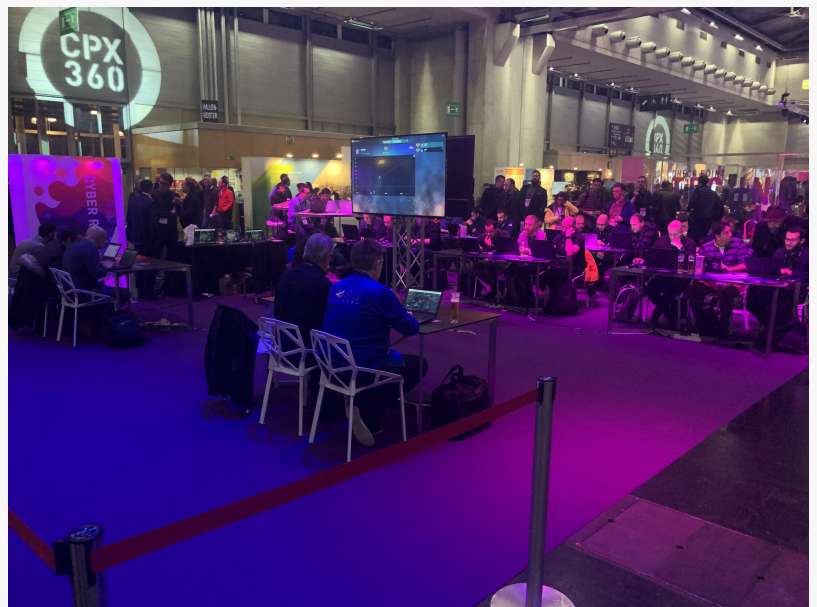
Cyber Range CPX Vienna