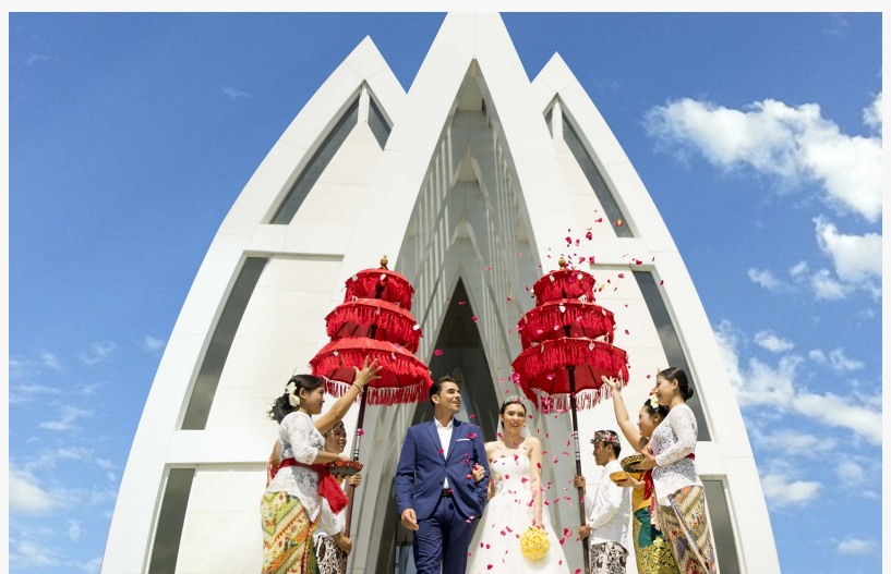
Wedding at Majestic Chapel

DENPASAR, BALI, INDONESIA, March 1, 2019 /EINPresswire.com/ -- Located on the island of the Gods, The Ritz-Carlton, Bali , is a dream wedding destination offering an exclusive array of inspiring wedding and event-related venues at scenic locations throughout the resort. Recognizing its role in creating memories to last a lifetime, the resort offers an exclusive range of wedding packages with all the options, as well as bespoke wedding services presented as an a la carte menu. Guests are invited to create the wedding of their dreams as they hand pick everything from venue, to flower arrangements, entertainment and photography services to start with.