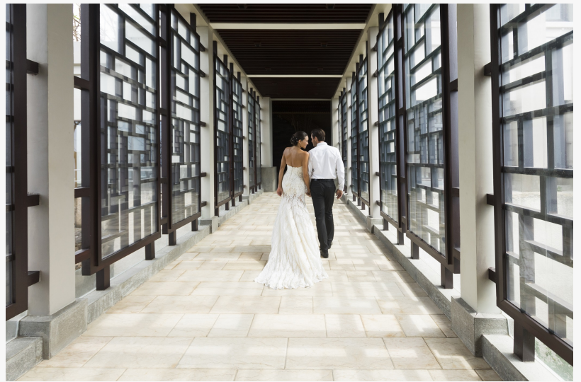
a happy wedding couple