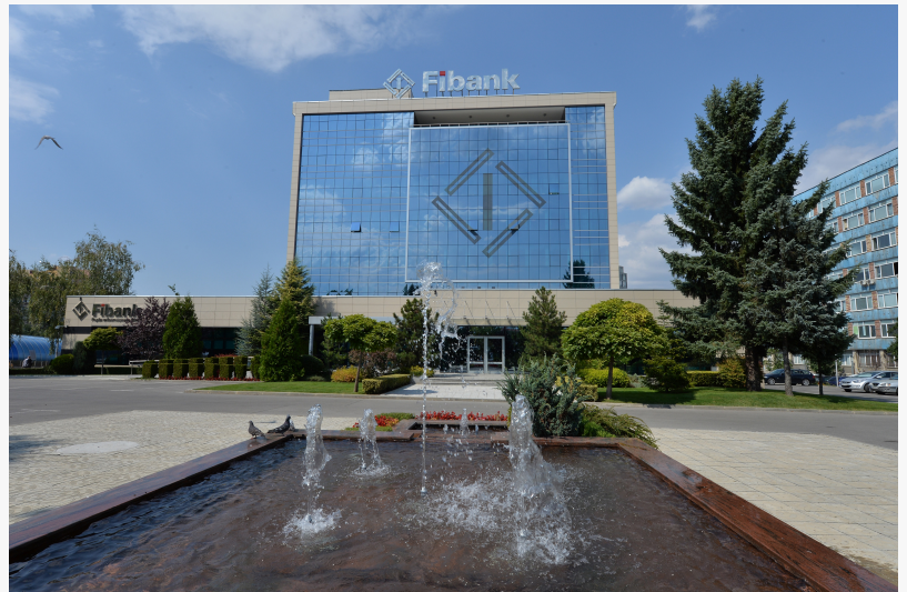
Fibank Head Office