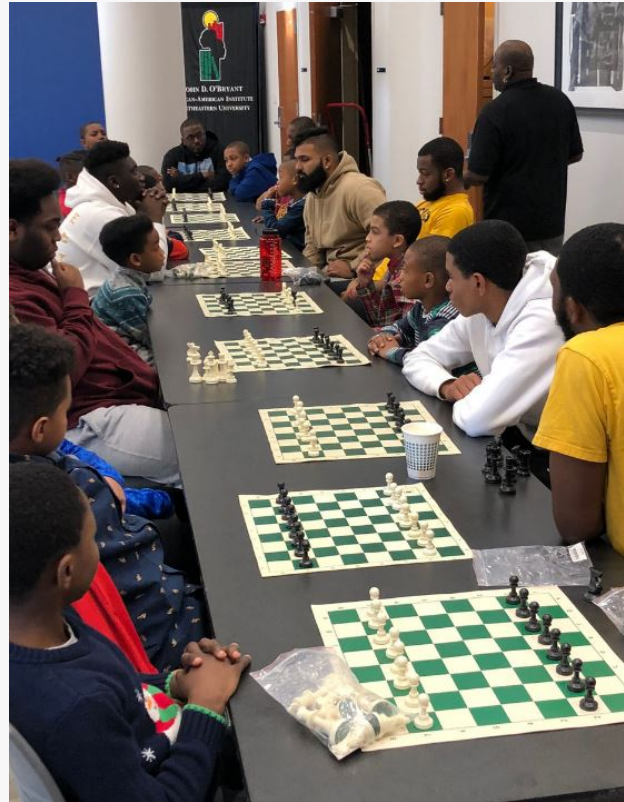
CBMM CHESS TOURNAMENT