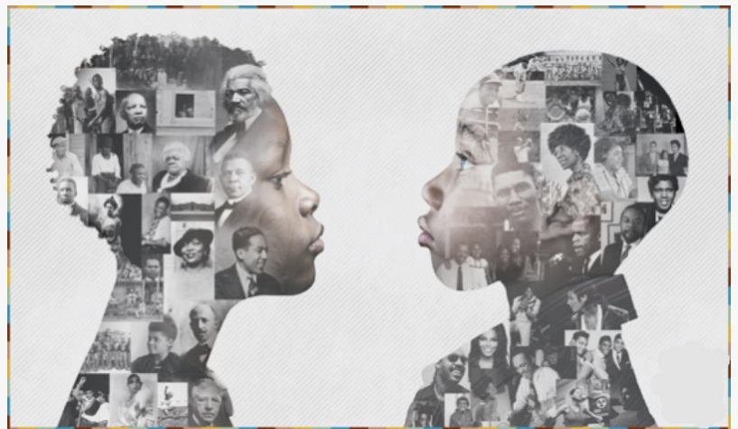
Learn Black History. Teach Black History. Create Black History

This press release can be viewed online at: http://www.einpresswire.com