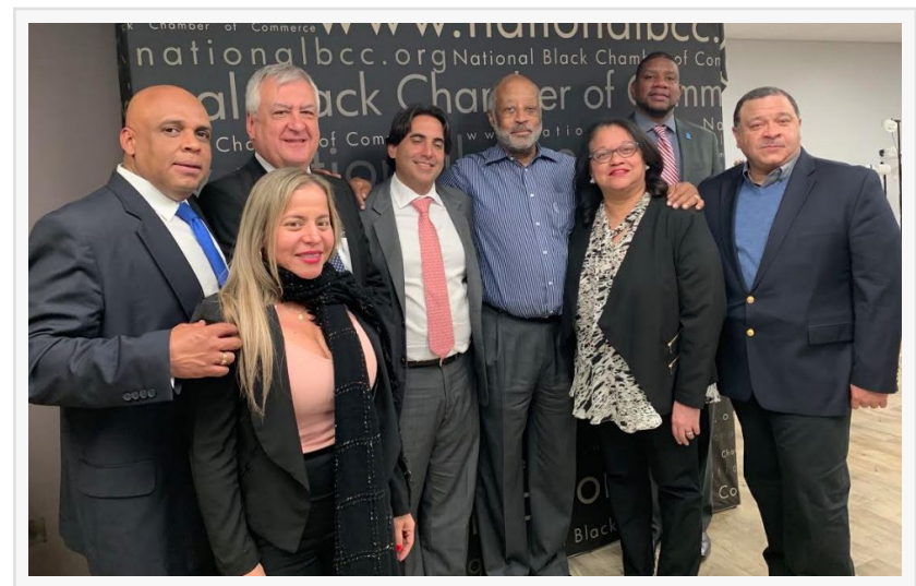
The NBCC & Comfandi (Colombia) Sign A MOU In Washington, DC Office

Kay DeBow National Black Chamber of Comm +1 202-466-4788 email us here Visit us on social media: Facebook Twitter Google+ LinkedIn