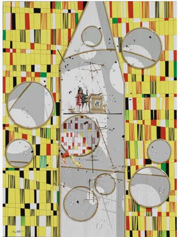
Philippe Bertho, L'Intru, (The Intruder), acrylic on canvas, 32 x 23.75 inches