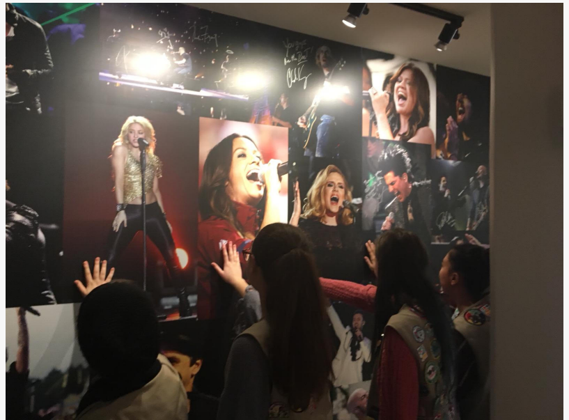
Troop 844 idolizing their inspirational figures at Entercom Communications Studio in New York

Artwork created by member of Troop 844 thanking social workers