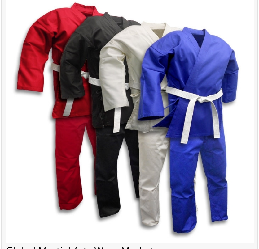
Global Martial Arts Wear Market

source of guidance and direction for companies and individuals interested in the industry.