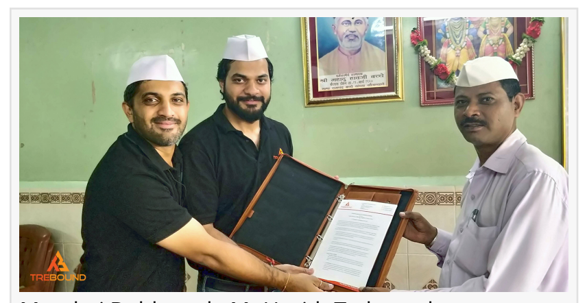
Mumbai Dabbawala MoU with Trebound

This 125-year old lunchbox-ferrying legacy business in Mumbai successfully delivers 2,50,000 lunches each week, through the year. Their complex, relentless business model is based on the sheer ownership and communication amongst the 5000 Dabbawalas. The near zero error rate