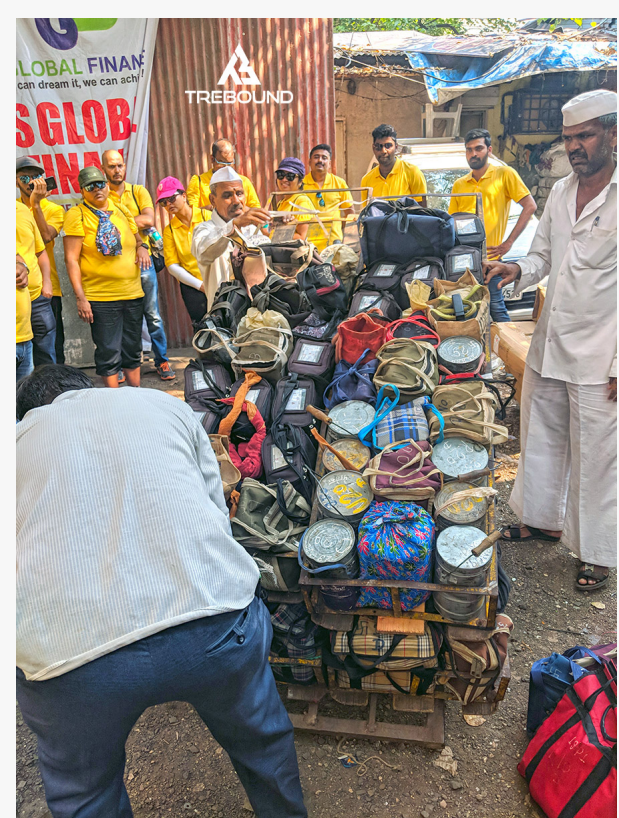
Sorting the Dabba's | Dabbawala | Trebound

has been a marvel of supply chain management that has been appraised on par with six sigma processes.