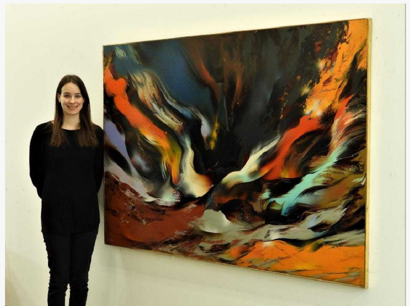
Large, 48 inch by 72 inch oil on Masonite by Leonardo Nierman (Mexican, b. 1932), an abstract expressionist composition featured vibrant waves of color ($4,375).