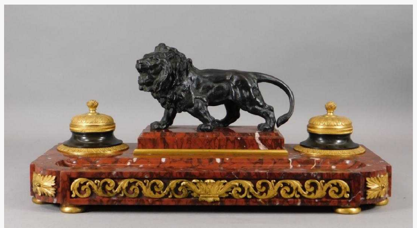
French 19th century ormolu bronze rouge marble inkwell with a patinated bronze model of a lion sculpture after a model by Antoine-Louis Barye (French, 1795-1875) ($2,250).