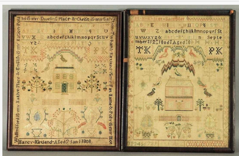
Matching pair of samplers, done by young sisters in Ohio in 1806 and 1808, done on silk and linen, with both measuring 14 inches by 11 inches, both framed ($10,000).

The samplers were beautifully executed in Wallingford, Ohio by the Kirkland sisters – Nancy, age 7 in 1808, and Sara, age 8 in 1806. Each sampler was decorated with a central home motif, surrounded by birds with strawberry bushes and trees. They were done on silk and linen, with both measuring 14 inches by 11 inches. Both were framed, with no glass in one of the frames.