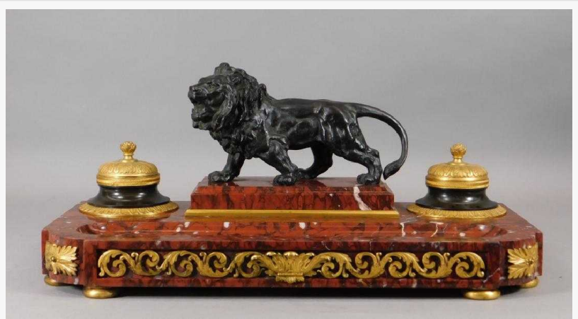
French 19th century ormolu bronze rouge marble inkwell with a patinated bronze model of a lion sculpture after a model by Antoine-Louis Barye (French, 1795-1875) ($2,250).

A French 19th century ormolu bronze rouge marble inkwell with a patinated bronze model of a lion sculpture after a model by Antoine-Louis Barye (French, 1795-1875), brought $2,250. The 17-inch-tall piece comprised a shaped marble plinth on bronze bun feet with inset acanthus leaf ormolu frieze adorned with a patinated bronze model of the lion, which was flanked by inkwells.