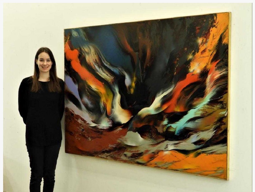
Large, 48 inch by 72 inch oil on Masonite by Leonardo Nierman (Mexican, b. 1932), an abstract expressionist composition featured vibrant waves of color ($4,375).