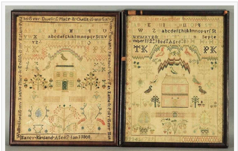
Matching pair of samplers, done by young sisters in Ohio in 1806 and 1808, done on silk and linen, with both measuring 14 inches by 11 inches, both framed ($10,000).

The samplers were beautifully executed in Wallingford, Ohio by the Kirkland sisters – Nancy, age 7 in 1808, and Sara, age 8 in 1806. Each sampler was decorated with a central home motif, surrounded by birds with strawberry bushes and trees. They were done on silk and linen, with both measuring 14 inches by 11 inches. Both were framed, with no glass in one of the frames.