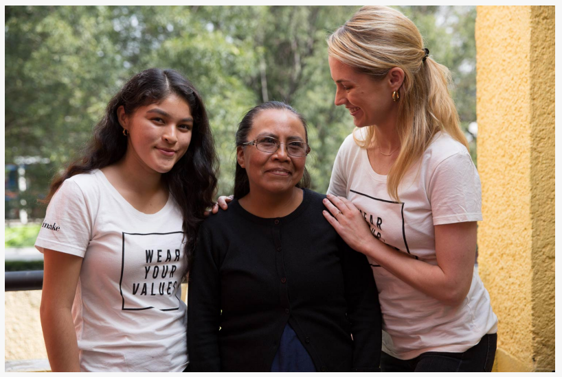
Remake Made in Mexico | Coming in April

culture of caring, and have set industry standards in Fair Trade and organic, healthier products. Privately-held, the company is a founding member of B Corporation, the Sustainable Working Group, Social Labor Convergence, and the Sustainable Apparel Coalition. Read more at INDIGENOUS.com and follow us on Twitter (@indigenousDesigns), Facebook (Indigenous) and Instagram (IndigenousDesigns).